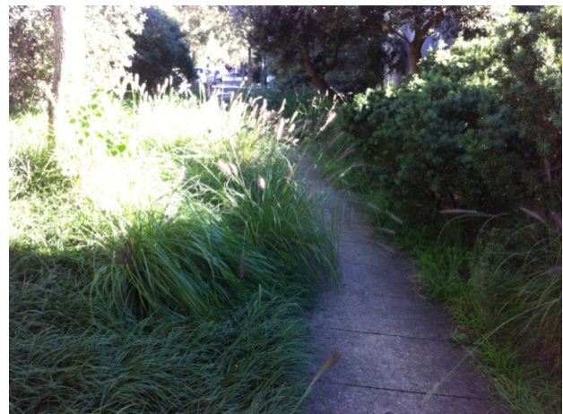
BEFORE - Example Of Overgrown Gardens Obstructing Pathway

Earlier this year the owners of 25 Spitz Ave & 27 Spitz Ave of our precinct applied to the NSW Civil & Administrative Tribunal (NCAT) for orders against the Executive Committee's approval of building works to their neighbour's home, 26 Tooth Ave. The Executive Committee is duty bound on behalf of the Community Association to respond to the matter before NCAT. An attempt to mediate the matter was unsuccessful and the matter progressed to a