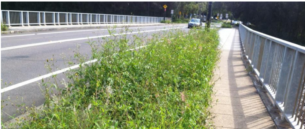
BEFORE - Overgrown pathways along Wing Parade

The executive committee lobbied SOPA to improve the landscaping at the Wing Parade entrance to Newington. (This area is maintained at SOPA's cost.) Feedback from residents has been very positive.