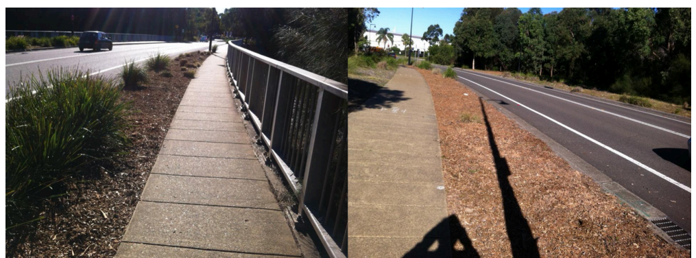
POST EC/SOPA meetings - pathway now weeded, mulched and maintained

The EC encourages residents to attend the AGM (date TBC), have your say and improve upon the record turnout which elected the current EC in October 2016 with an overwhelming majority.